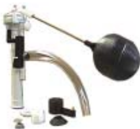
REPLACEMENT BALLCOCK TO FIT KOHLER RIALTO

- Non corrosive, no float or rod needed. Built-in filter screen saves water and replaces old fashioned ballcocks.