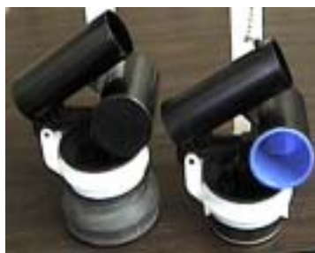
#5 & #6 FLUSHVALVES FOR AMERICAN STANDARD

- Furnished brass seat, lugs & screws. Replaces American Standard #47086-07