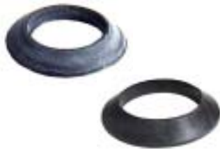
BEVELED FLUSHVALVE WASHER