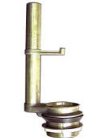
BRASS DOUGLAS FLUSHVALVE