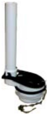
PLASTIC DOUGLAS FLUSHVALVE