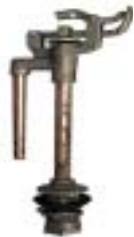
ELEVATED BRASS BALLCOCK