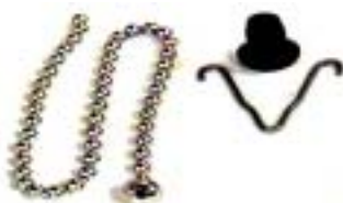
CHAIN KIT TO FIT AMERICAN STANDARD FLUSHVALVES