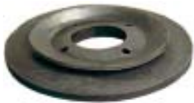
SEAL TO FIT MANSFIELD 209 FLUSHVALVES