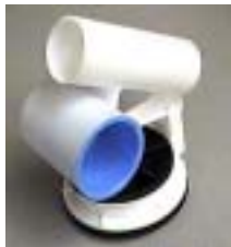
#4 FLUSHVALVE FOR AMERICAN STANDARD

- 3" O.D. x 2 3 / 8 " I.D. x 3/ 8 " High