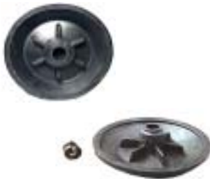
REPLACEMENT FOR AMERICAN STANDARD SEAT DISC