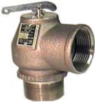
LOW-PRESSURE STEAM BOILER SAFETY VALVE -STANDARD-