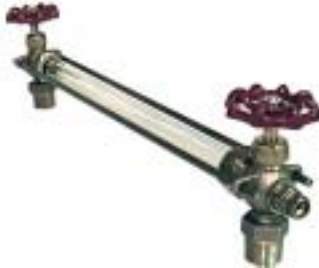
STANDARD ROUGH BRONZE WATER GAUGE SETS