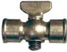
DOUBLE FEMALE AIRCOCK