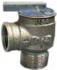
3/4" A.S.M.E. SAFETY RELIEF VALVE FOR HOT WATER BOILERS