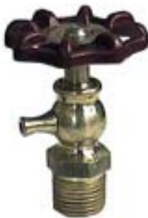
COMPRESSION GAUGE COCK (TRICOCK)