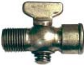
MALE X FEMALE AIRCOCK