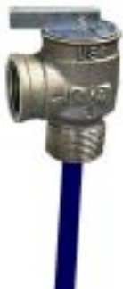
WATER HEATER RELIEF VALVE