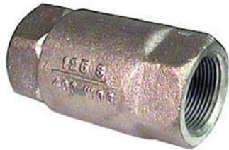
BRONZE BALL-CONE® CHECK VALVES