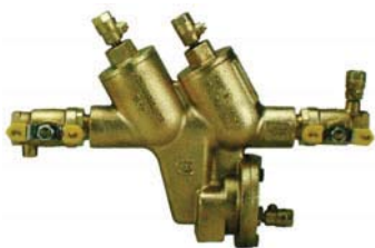
RP-40 SERIES REDUCED-PRESSURE BACKFLOW (RPZ)