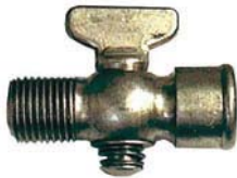
MALE X FEMALE AIRCOCK