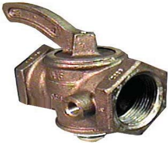
MAIN BURNER CONTROL VALVES