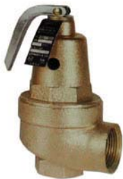
30 PSI RELIEF VALVE FOR STEAM BOILERS -STANDARD-