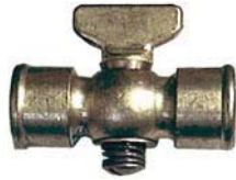
DOUBLE FEMALE AIRCOCK