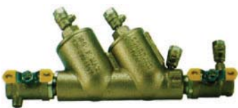
DC-40 SERIES TOP-ENTRY DOUBLE CHECK BACKFLOW