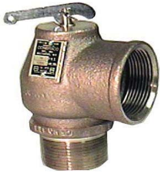
15 PSI RELIEF VALVE FOR STEAM BOILERS -STANDARD-