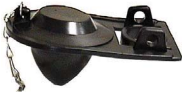
WAL-RICH ECONOMY FLAPPERS