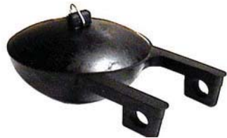
FLAPPER TO FIT KOHLER