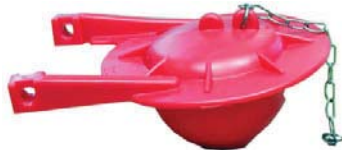
3" FLAPPERS TO FIT KOHLER