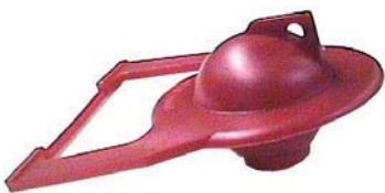
NEW-STYLE FLAPPER TO FIT KOHLER RIALTO®