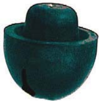
WAL-RICH ELJER-STYLE TANK BALLS