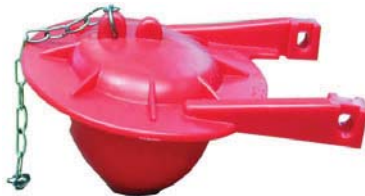
FLAPPER TO FIT TOTO "G-MAX" TOILETS