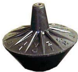
WAL-RICH TRIPLEX TANK BALLS