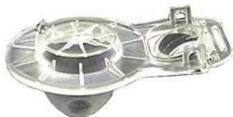
CLEAR VINYL FLAPPER