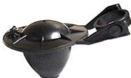
BLACK FLAPPER TO FIT PLASTIC DOUGLAS VALVE