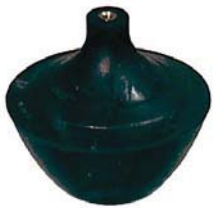
WAL-RICH FIT-ALL TANK BALLS