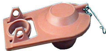
"CROWN" ORANGE SILICON FLAPPER