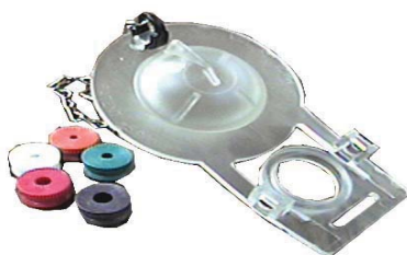
CLEAR VINYL FLAPPER WITH "TIME-TIPS"