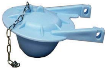
FLAPPER TO FIT TOTO "POWER GRAVITY" TOILETS