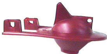
NEW-STYLE FLAPPER TO FIT KOHLER AQUALINE®