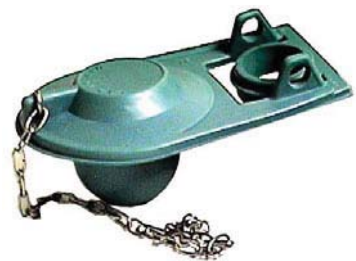
TEAL PREMIUM SILICON FLAPPER