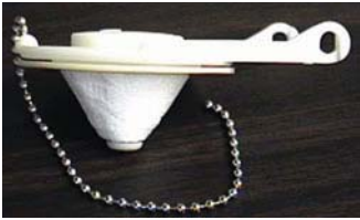
FLAPPER TO FIT ELJER "LOW-BOY"