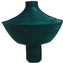
WAL-RICH NON-JIGGLE TANK BALLS