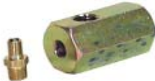
GAS TEST MANIFOLD & AIR VALVE

Please note: This gauge is extremely sensitive. Overpressurizing this gauge will cause the measuring element to fail and render the gauge inoperable. Wal-Rich will not accept returns of gauges that are improperly used.