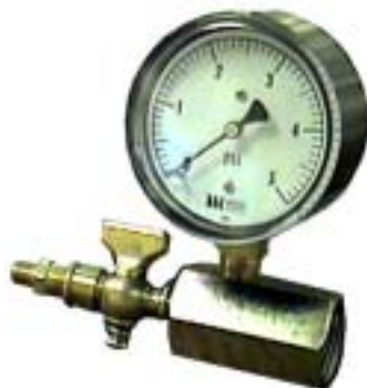
5 PSI & 10 PSI LOW-PRESSURE GAS TEST ASSEMBLY