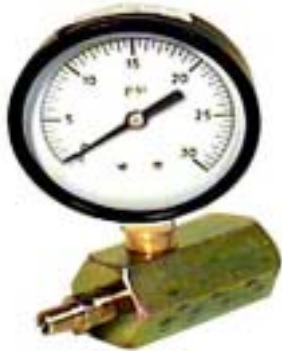
STANDARD GAS TEST ASSEMBLY