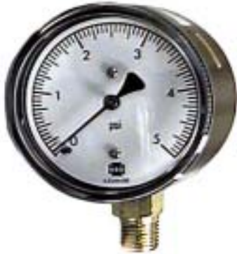
5 PSI & 10 PSI DIAPHRAGM GAUGE FOR GAS TEST