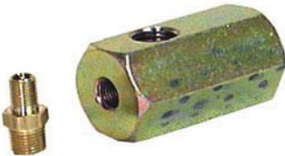
GAS TEST MANIFOLD & AIR VALVE

Please note: This gauge is extremely sensitive. Overpressurizing this gauge will cause the measuring element to fail and render the gauge inoperable. Wal-Rich will not accept returns of gauges that are improperly used.