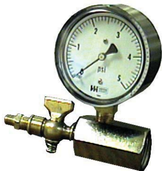
5 PSI & 10 PSI LOW-PRESSURE GAS TEST ASSEMBLY