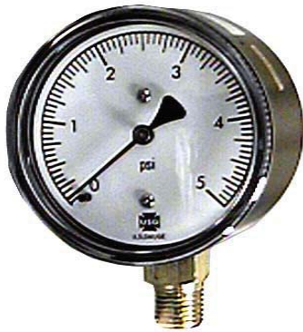
5 PSI & 10 PSI DIAPHRAGM GAUGE FOR GAS TEST