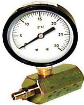
STANDARD GAS TEST ASSEMBLY