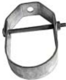
LIGHT DUTY -COPPERIZED- CLEVIS HANGERS