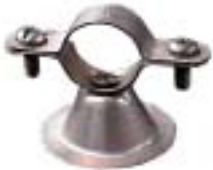
COPPERIZED BELL HANGERS