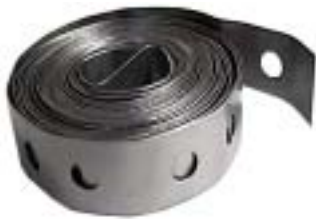
PERFORATED GALVANIZED DUCT HANGING IRON

- For copper, PEX, and polybutylene tubing - For use in metal studs and galvanized pipe support brackets.