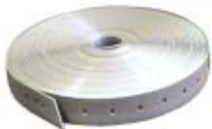
PERFORATED PVC HANGING TAPE

- 3/4" x 10 foot - With nail holes (1/4" )