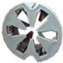
PVC METAL STUD INSULATORS

- For copper, PEX, CPVC and polybutylene tubing