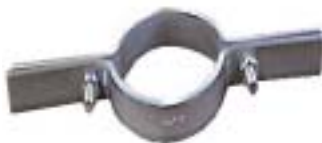
- COPPERIZED - STEEL RISER CLAMPS