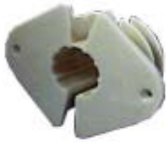
PVC PIPE INSULATORS

- For copper, PEX, CPVC and polybutylene tubing - Plastic two hole pipe clamp reduces noise from tubing expansion & contraction.