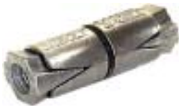
DOUBLE EXPANSION SHIELDS