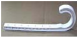
WHITE ABS J-HOOKS