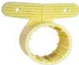
PVC SUSPENSION CLAMP

- Plastic half clamp preloaded with nail. For copper, PEX, CPVC and polybutylene tubing. - Isolates tubing from wood to prevent vibration noise