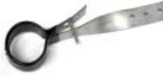
PVC-COATED DWV HANGERS