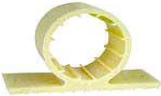
PVC TWO-HOLE PIPE STRAPS