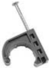
PVC TUBE NAILER