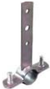
COPPERIZED MILFORD HANGERS