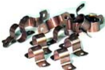
COPPER-CLAD TWO-HOLE PIPE STRAPS