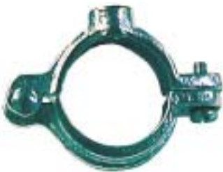
SPLIT-RING HANGER (HINGE-TYPE)

Hinge design makes installation easier and saves time