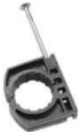
PVC "ALL-AROUND" NAILER

- Plastic half clamp preloaded with nail. For copper, PEX, CPVC and polybutylene tubing.