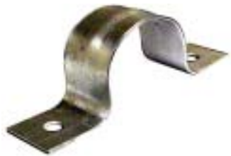
GALVANIZED TWO-HOLE PIPE STRAPS