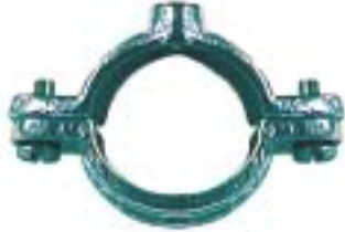
SPLIT-RING HANGER (SCREW TYPE)