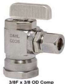
3/8F x 3/8 OD Comp

GENUINE DAHL MINI-BALL® QUARTER-TURN STOPS -ANGLE-