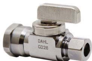
3/8F x 3/8 OD Comp

GENUINE DAHL MINI-BALL® QUARTER-TURN STOPS -STRAIGHT-