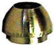
BRASS BASIN NOSEPIECE