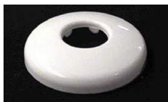
WHITE PLASTIC SURE GRIP FLAT ESCUTCHEON