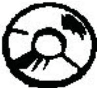
BRASS FRICTION RINGS