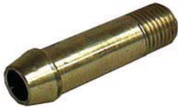
BRASS BASIN TAILPIECE