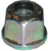
BASIN COCK COUPLING NUT