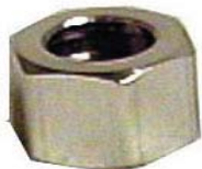
3/8" COMPRESSION NUT