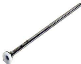
FLEXIBLE TANK SUPPLY TUBES