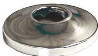
ROUGH BRASS FLAT ESCUTCHEON