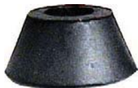
BEVELED RUBBER TANK SUPPLY WASHER