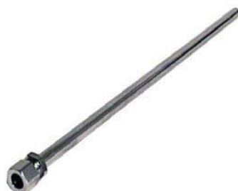
COMPRESSION "DELTA" STYLE SUPPLY TUBE