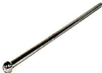
FLEXIBLE BASIN SUPPLY TUBES