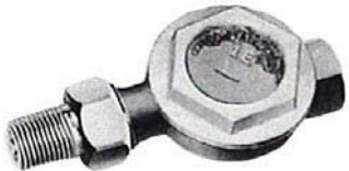
MEPCO™ STRAIGHT STEAM TRAPS