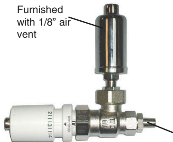
OVENTROP® ONE-PIPE STEAM ASSEMBLIES