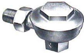
BARNES & JONES™ ANGLE STEAM TRAPS

- Low pressure radiator trap--good for 25" vacuum to 25 psi