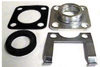
UNIVERSAL ADAPTER KITS WATER HEATER ELEMENTS