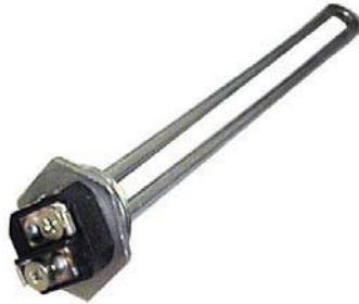
SCREW-IN WATER HEATER ELEMENTS