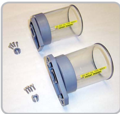
AMR Adapters for Dresser Series B3 meter