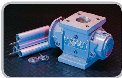
Dresser Series B meter bodies accept a wide range of Series 3 accessories for all metering applications

Dresser meters are manufactured in accordance with ANSI B109.3 for Rotary Type Gas Displacement Meters. Dresser Series B3 meter sizes 8C through 56M, have flanged inlet and outlet connections conforming dimensionally with ANSI/ASME standards. Sizes 8C through 2M are available with 1-1/2" NPT connections, upon special request. The meter operating temperature range is from -40°F to +140°F (-40°C to +60°C) while the temperature compensating mechanism of the mechanical TC accessory provides a corrected reading for temperatures ranging from -20°F to +120°F (-29°C to +49°C).